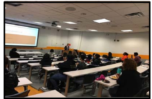
There was a good turn-out for the first Honors Club meeting of the fall semester.